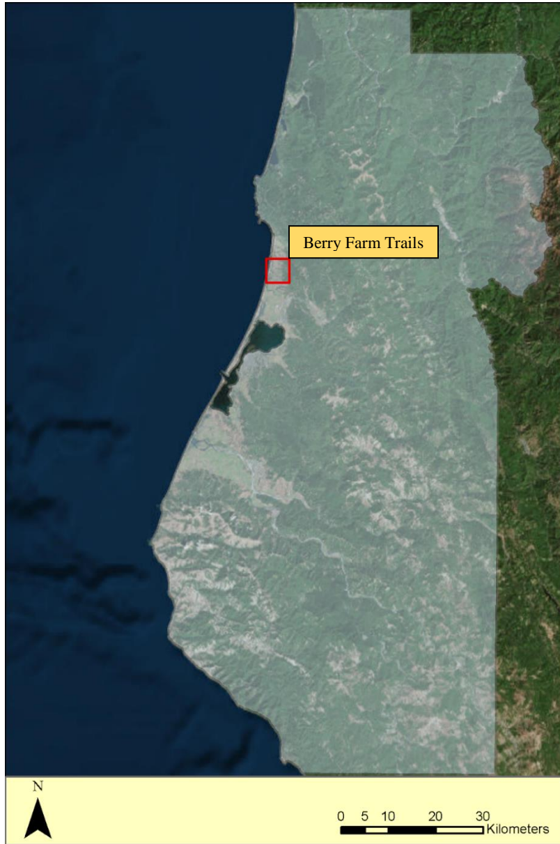
Figure 1. Location map of study site in Humboldt Co. CA, USA on December 2014.

The map provides main roads, trails and their names, common land marks, streams, water sources, and present logging areas. The possible routes show in yellow dash line refer to trails that are exist, but not able to see from the satellite image (Figure 2).